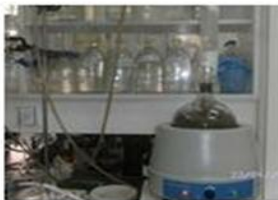
Fig.1. Hydrodistillation of Schinus molle . Installation of hydrodistillation (Clevenger apparatus) [17]

2.2. Hydrodistillation: The extraction of essential oil was done by hydrodistillation; in a Clevenger apparatus by immersing 100g of dry leaves in 600 ml distilled water, and then distilled for 3h (fig .1). The resulting essential oil was dried with Calcium chlorate ( \text{CaCl}_2 ) and stored in the dark at +4^\circ\text{C} .